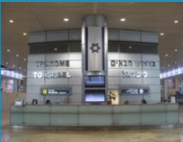
Ben Gurion Airport, Tel Aviv