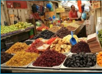
Machane Yehuda Market