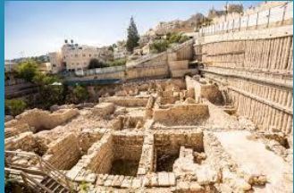
City of David