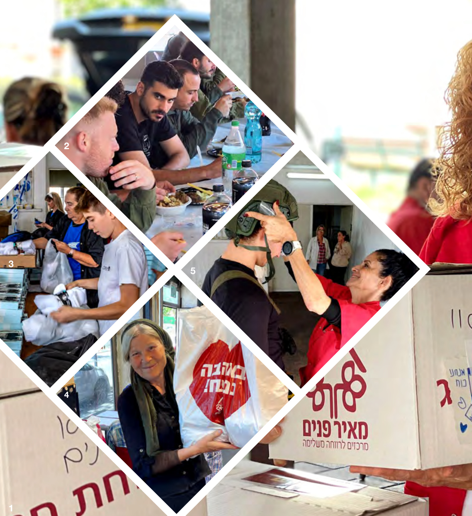
1. Abraham's Bread worker preparing boxes of food for distribution. 2. Soldiers on the frontlines sharing a meal provided by Abraham's Bread. 3. Volunteers help pack care packages for displaced families from